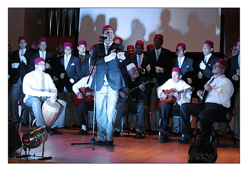
Opening Ceremony The Young Caballeros perform an exciting program.

scientific collaboration and exchange of ideas among psychologists around the world. Crosscultural psychology is not a well-established branch of science in South Africa despite the country being a multicultural society with huge diversity. The Congress also wanted to attract more attention to cross-cultural research in South Africa and stimulate psychological theories in all branches of psychology and related disciplines. Lastly, the IACCP Congress could be an important catalyst to unlocking aware-