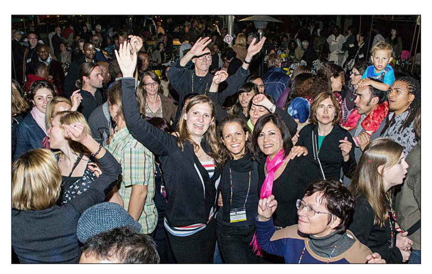
Dinner dance Dance party at the Congress banquet (a crucial IACCP tradition).

As always, the Congress dinner, held on 20 July 2012, was a highlight. Busses transported delegates to the prestigious Spier wine estate on the outskirts of Stellenbosch. In a magical setting amidst the ancient oaks and colonial splendor of the historical Spier