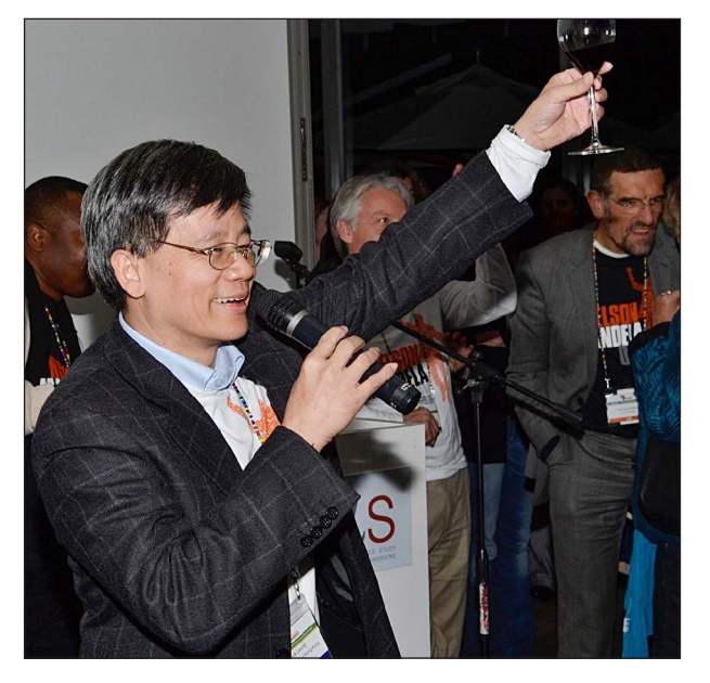
Welcoming newcomers President Kwok Leung welcomes new IACCP members at the wine tasting party.

The social programme lived up to the usual high expectations of IACCP delegates when they were treated to a cheese and wine evening at the Wallenberg Centre, Stellenbosch Institute for Advanced Study (STIAS), on 18 July 2012. A number of the prestigious Stellenbosch wine farms served some of the best wines in the region that evening. Kwok Leung, president of the IACCP, hosted a party at the STIAS manor house welcoming new IACCP members with a glass of JC le