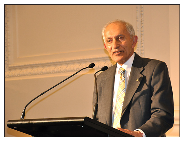
Prof. David de Kretser Governor of Victoria state.

some delays at the time of registration (and some difficulties in locating the venues), participants were off to a good start for the day. Some symposia had to be scheduled in parallel with workshops due to better than expected symposium submissions, and because some late arrivals were expected from other conferences held elsewhere in Australia. But by the end of the first day, most delegates were present and ready for a welcome reception, which was held at the Immigration Museum, located an easy tram ride from the conference venue. A modern museum filled with the history of immigration to Australia from all over the world provided a poignant occasion with a